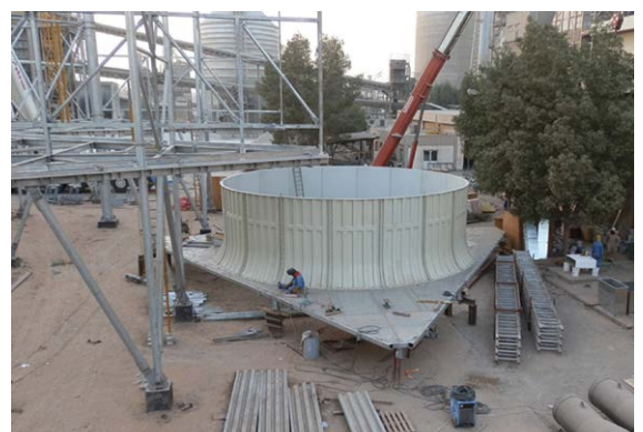
Preassembling on ground level