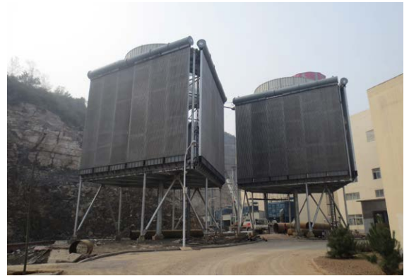
ENEXIO Delta Cell means extra space

ENEXIO Service GmbH Dorstener Str. 18 – 29 44651 Herne, Germany Phone +49 234 980 2000 service@enexio.com www.enexio.com