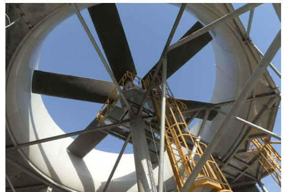
No fan bridge vibration risk