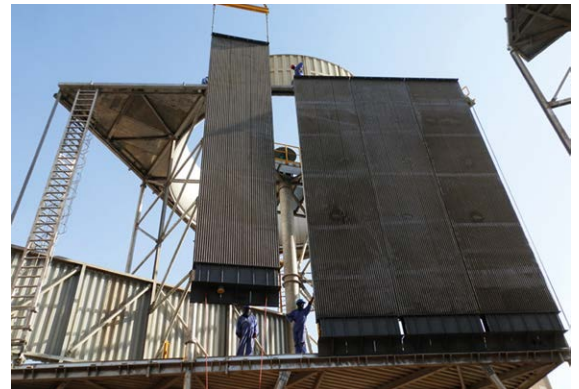
Easy tube bundle erection