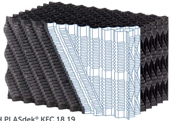
2H PLASdek® KFC 18.19

*Depending on recipe/additives higher temperatures can be reached by HT-additives.